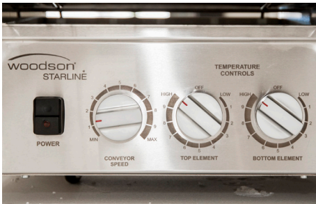
Individual temperature and speed controls

The Snack Master Small is sized to fit on any benchtop, allowing for perfect toasting.