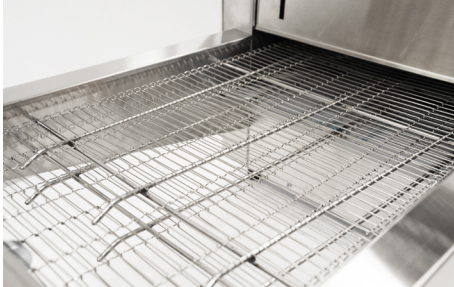
Belt extension for easy loading