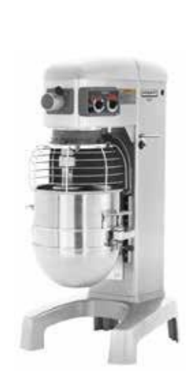
Model HL400 40 I bowl capacity