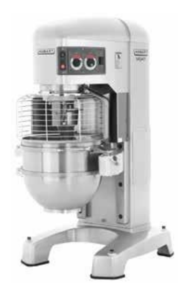
Model HL800 80 I bowl capacity