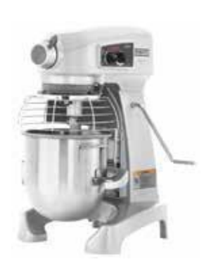
Model HL200 20 I bowl capacity