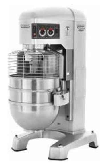
Model HL1400 140 I bowl capacity