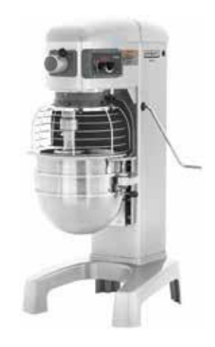
Model HL300 30 I bowl capacity