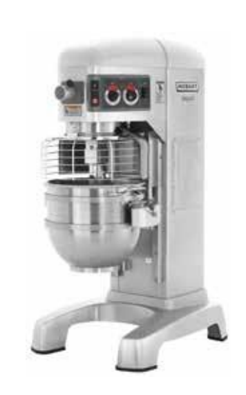
Model HL600 60 I bowl capacity