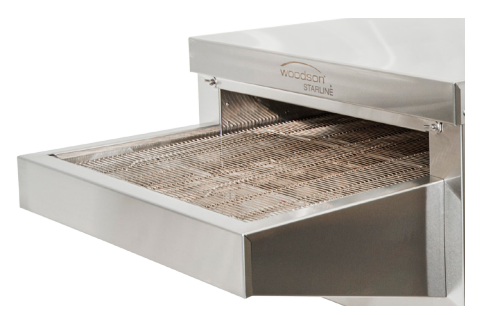
Left and right feed available

The P18 is Starline's smallest pizza conveyor. It provides a robust, user friendly and efficient way of cooking up to approx 38 x 9" pizzas per hour.