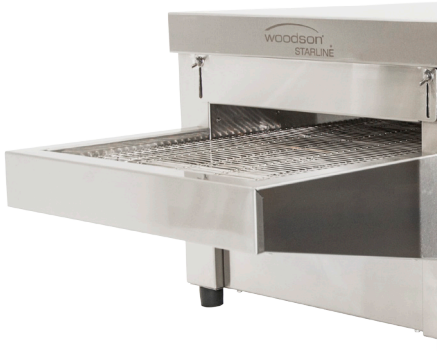
Long conveyor belt for easy loading