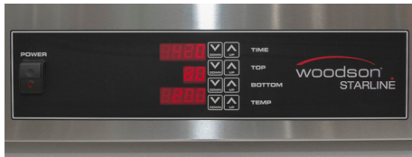
Touch pad "set and forget" control panel

Starline's largest compact unit, the Snackmaster 30, is designed to suit any bench space providing a durable, functional and accessible cooking environment.