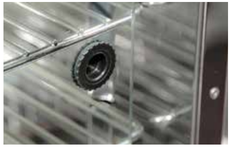
Toughened glass sliding doors

Woodson pie/food displays ensure pre-cooked food is held at a proper serving temperature whilst being displayed to enhance optimum sales.